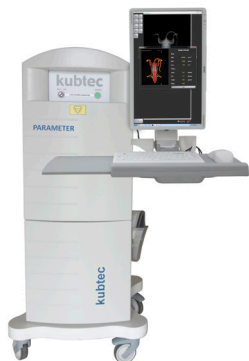
PARAMETER™ Cabinet X-ray System

The DIGIMUS® Software is available on a variety of KUBTEC® X-ray imaging platforms: