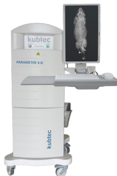
PARAMETER™ 3D Tomosynthesis System